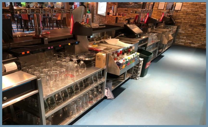
Haven Hopton Holiday Park, Great Yarmouth – Back of Bar