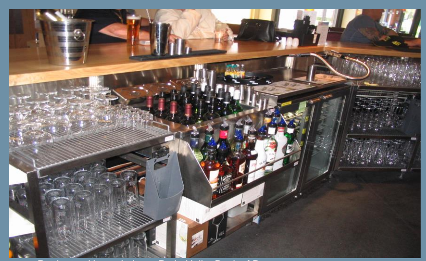
Patrington Haven Leisure Park, Hull – Back of Bar