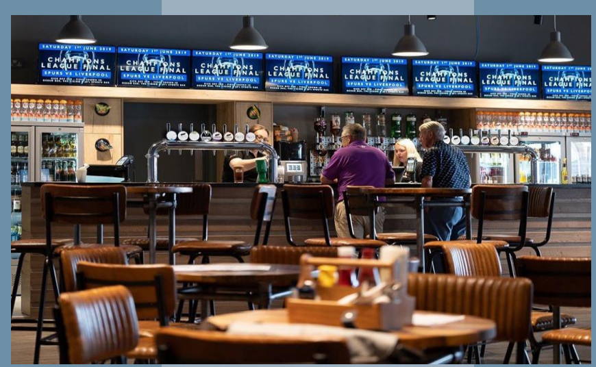
White Horse Caravan Park, Chichester - Customer Facing