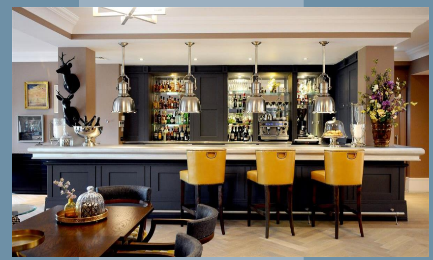
Audley Chalfont Dene, Chalfont St Peter - Customer Facing